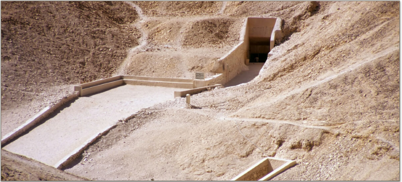
(Valley of the Kings tomb entrance)

After lunch, we will stay on the west side of the Nile River for the afternoon and visit the amazing Mortuary Temple of Hatshepsut , the daughter of pharaoh who found Moses in the Nile. As a woman in a traditionally male position of power, Hatshepsut (1479-1458 BC) understood she needed to establish her authority and the legitimacy of her reign in more obvious ways than her predecessors and the scale and elegance of her temple is evidence of this. Her temple surpassed all previous monumental works in her time.