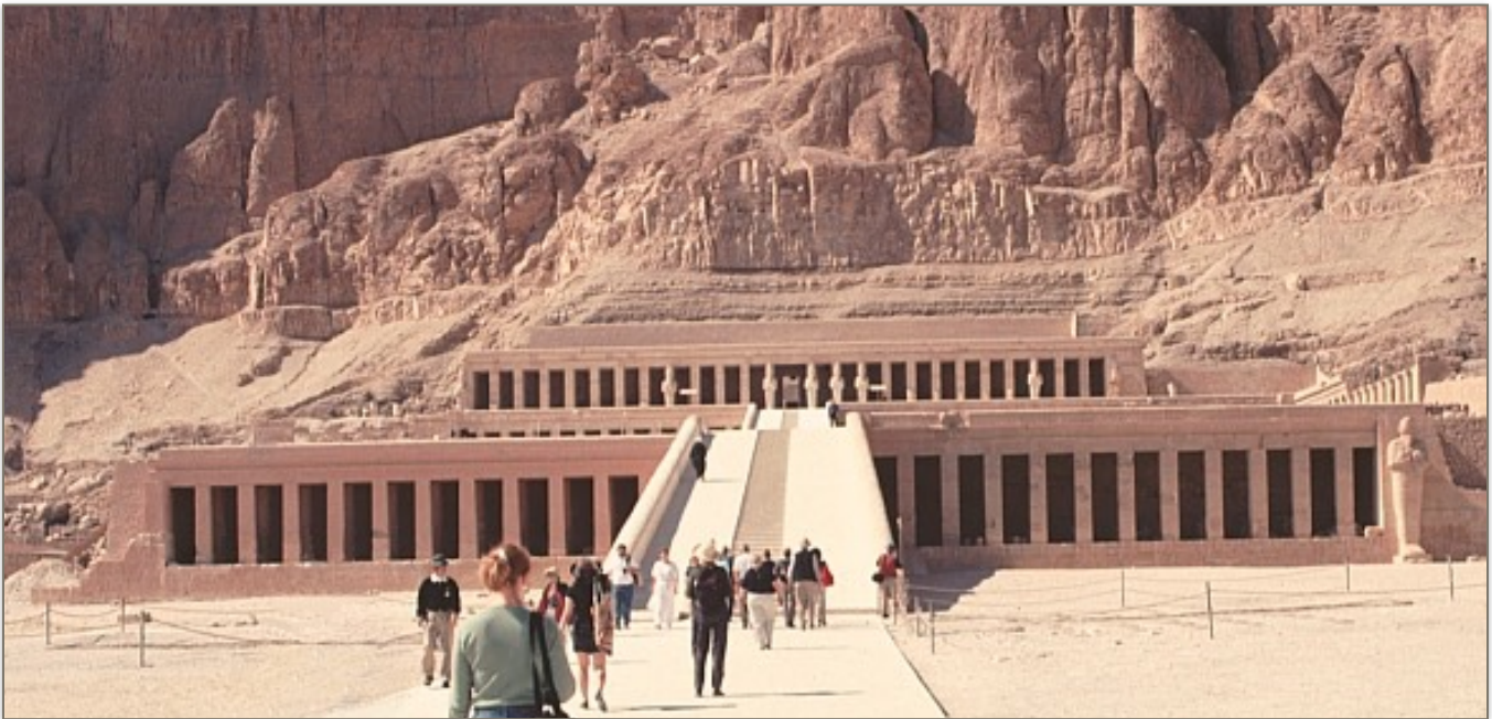
(Entrance to the Temple of Hatshepsut)

After lunch, we will stay on the west side of the Nile River for the afternoon and visit the amazing Mortuary Temple of Hatshepsut , the daughter of pharaoh who found Moses in the Nile. As a woman in a traditionally male position of power, Hatshepsut (1479-1458 BC) understood she needed to establish her authority and the legitimacy of her reign in more obvious ways than her predecessors and the scale and elegance of her temple is evidence of this. Her temple surpassed all previous monumental works in her time.