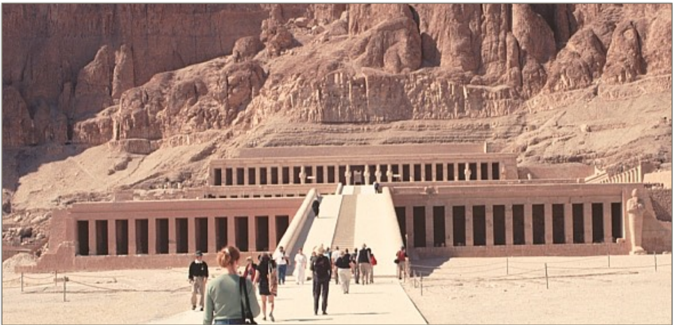
(Entrance to the Temple of Hatshepsut)

After lunch, we will stay on the west side of the Nile River for the afternoon and visit the amazing Mortuary Temple of Hatshepsut , the daughter of pharaoh who found Moses in the Nile. As a woman in a traditionally male position of power, Hatshepsut (1479-1458 BC) understood she needed to establish her authority and the legitimacy of her reign in more obvious ways than her predecessors and the scale and elegance of her temple is evidence of this. Her temple surpassed all previous monumental works in her time.