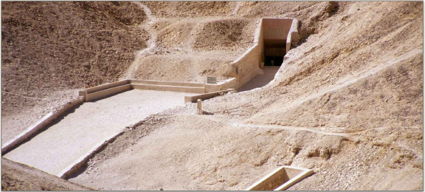
(Valley of the Kings tomb entrance)

After lunch, we will stay on the west side of the Nile River for the afternoon and visit the amazing Mortuary Temple of Hatshepsut , the daughter of pharaoh who found Moses in the Nile. As a woman in a traditionally male position of power, Hatshepsut (1479-1458 BC) understood she needed to establish her authority and the legitimacy of her reign in more obvious ways than her predecessors and the scale and elegance of her temple is evidence of this. Her temple surpassed all previous monumental works in her time.