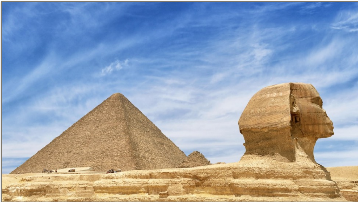
(Pyramids of Giza)