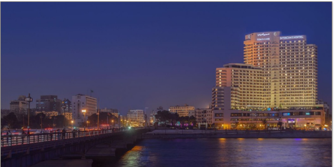
(Semiramis InterContinental Hotel, Cairo, Egypt)

After a full day of touring, we will board a short one hour flight back to Cairo, where we will have dinner and enjoy the beautiful Semiramis InterContinental Hotel by the Nile River.