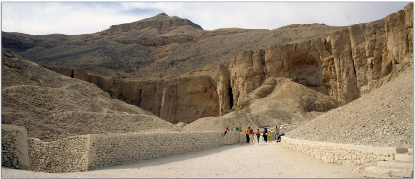
(Valley of the Kings in Luxor, Egypt)

After breakfast we will drive to the Valley of the Kings which is the burial place of many pharaohs, including those before and after the Exodus.